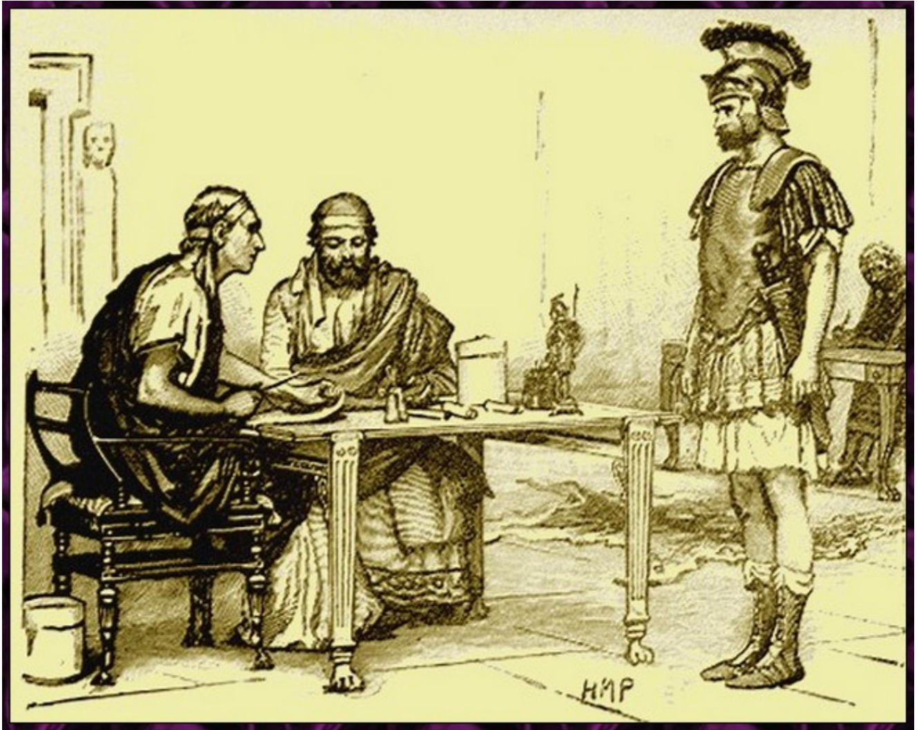
Fabius before the Governor

"Do you know their place of meeting?" asked the Governor.