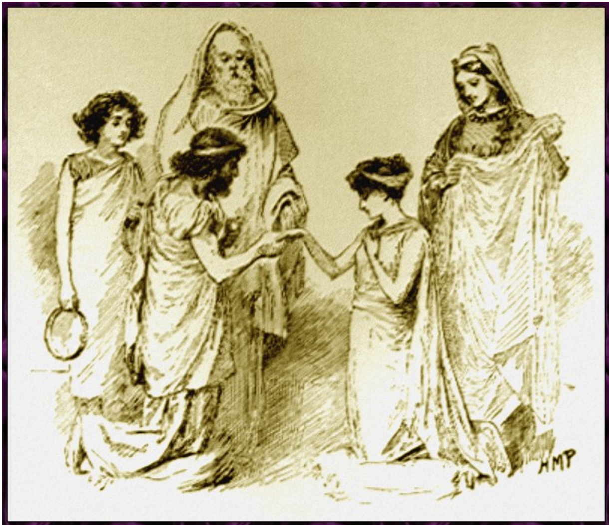
The Marriage of Bion and Rhoda.

Rhoda was now a beautiful young woman of two-and-twenty; but no suitor had hitherto touched her heart. Bion, in the full strength of his matured manhood, for he was now close upon the borders of forty, with the double romance of his strange conversion and his old life of adventure, took it by storm. The lovers were married on the day after his baptism, and took possession of the Bithynian farm before the end of the year.